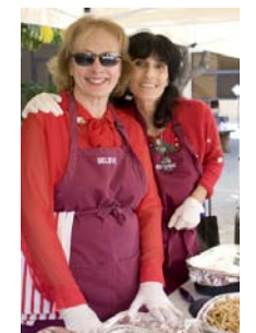
PazNaz 2010 Christmas Party